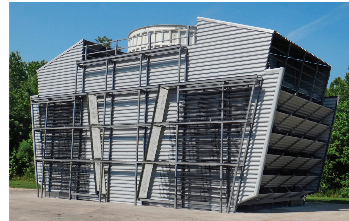
Full scale Series ESX crossflow FM test cell.

The Series ESX and ESXR products use SafeWall™ custom fire retardant fiberglass casing technology to resist natural hazards such as airborne missiles and hurricane force winds. This material is used for both endwalls and transverse partitions