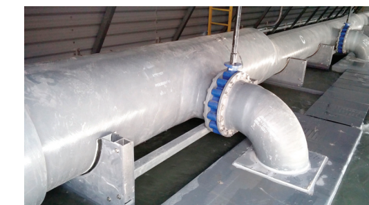
Fire-retardant water distribution system.