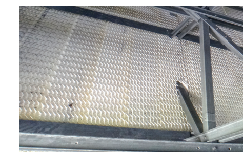
Series ESX FM test cell with Franklin™ eliminators