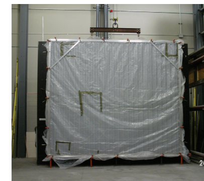
SafeWall™ cyclic wind pressure testing