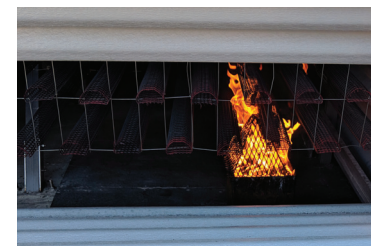
Heptane ignition source for full-scale fire testing