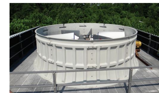
Series ESX test cell under construction with FR fan cylinder.