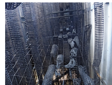
Following a successful Series ESX full-scale fire test there is minimal damage.