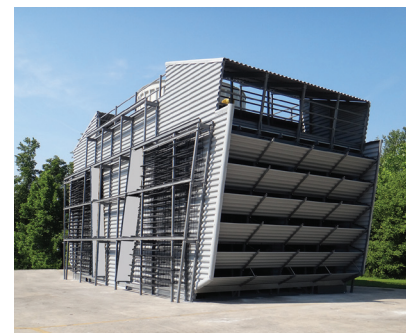
ESX full-scale fire test cell.