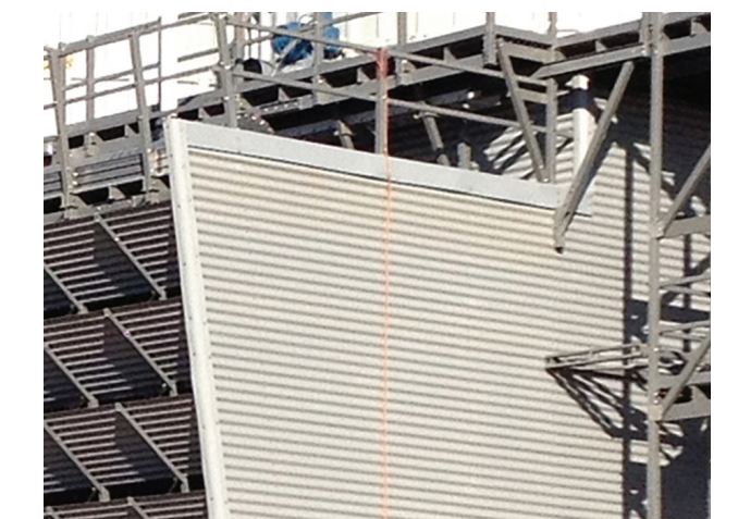
Series ESX SafeWall™ custom fire retardant fiberglass casing and partitions..